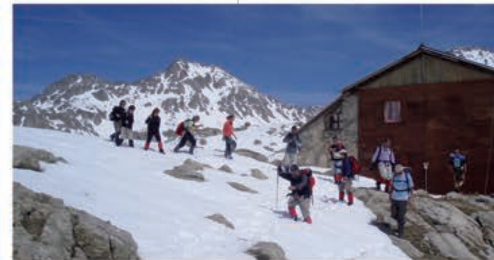
Refuge of the Colomina