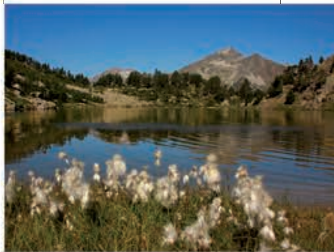
Estany de Besiberri