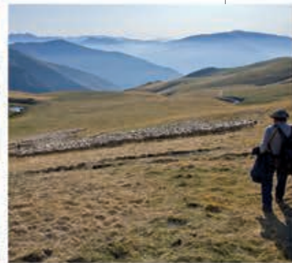
Cattle landscape in Llessui's mountains