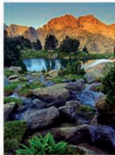
Estany de la Llosa