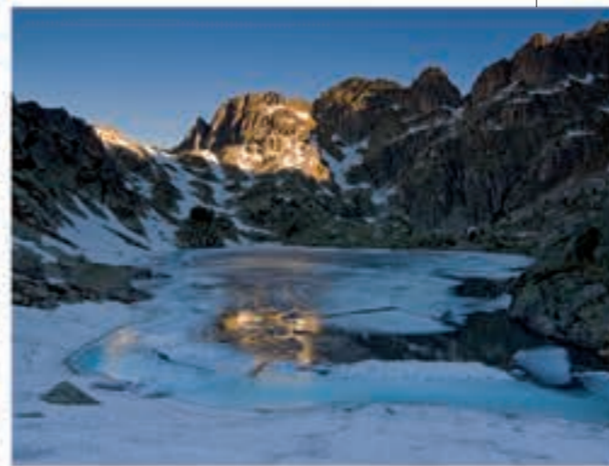
Estany dels Barbs