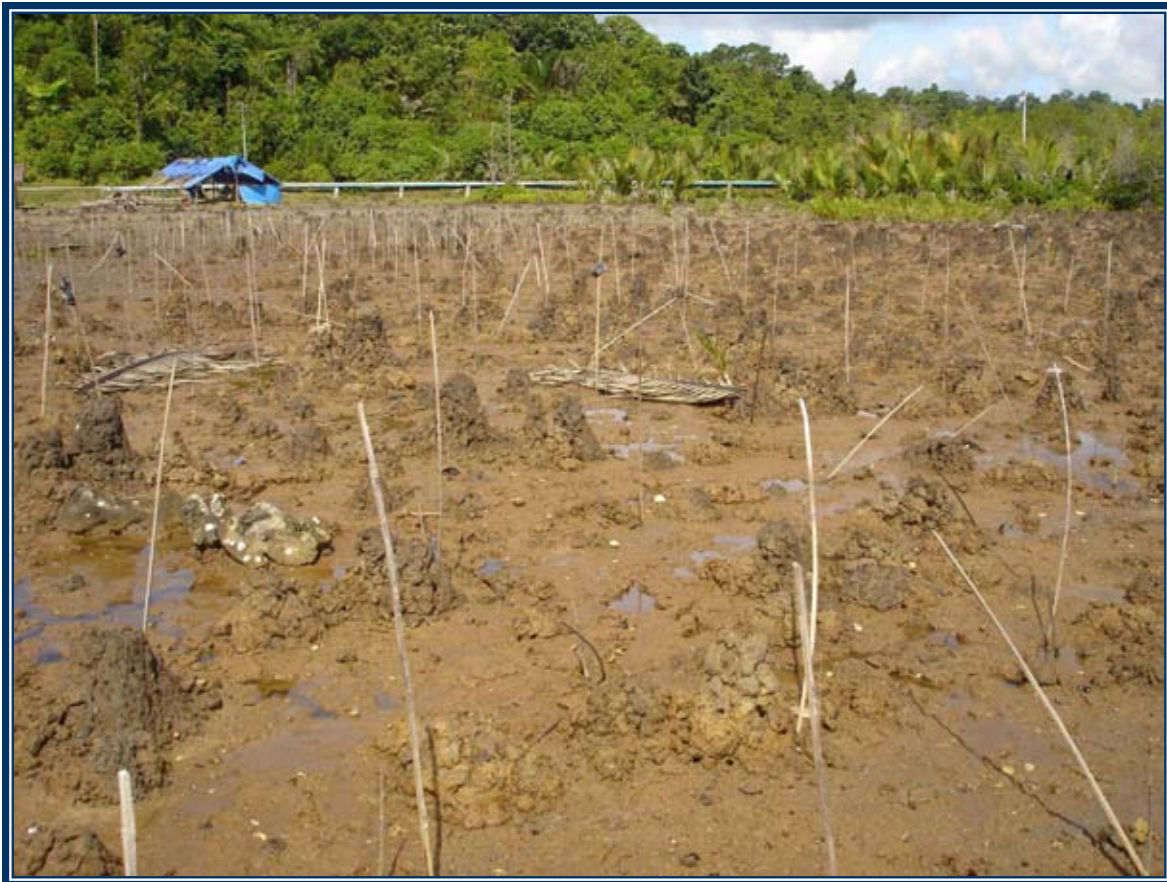
100 percent mortality of planted Rhizophora apiculata on Simeulue Island - Aceh Planted by Australian Red Cross

Benjamin Brown and Woro Yuniarti November, 2008