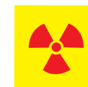
Equipment with radioactive sources