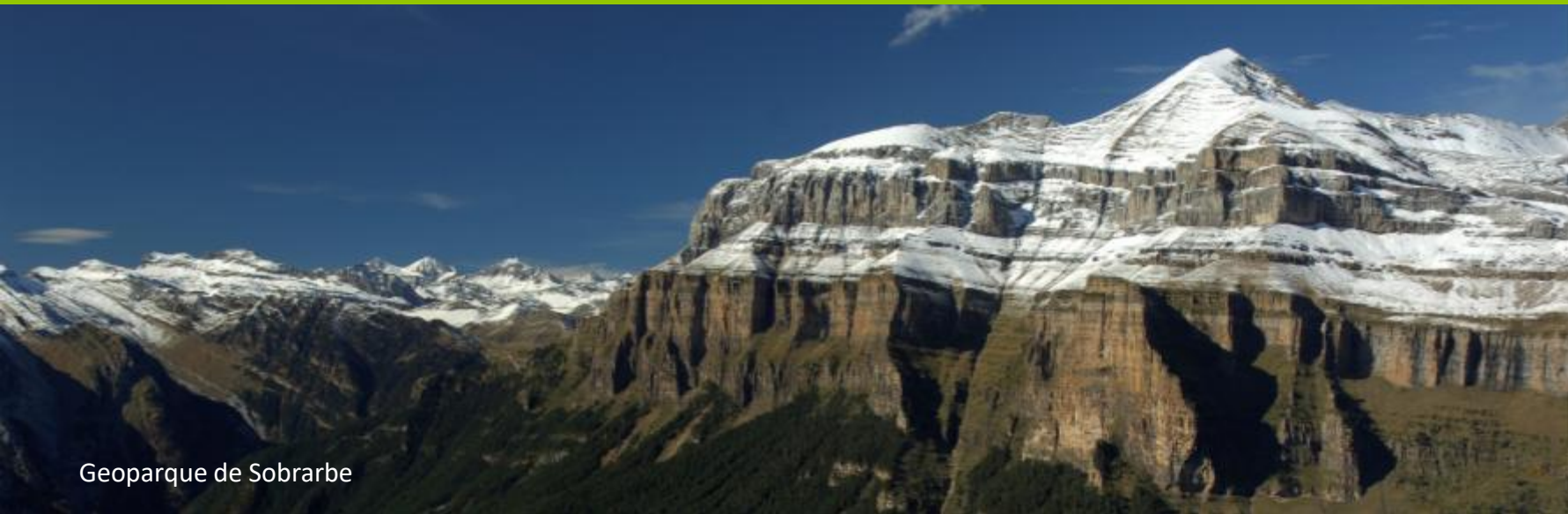
Geoparque de Sobrarbe

4º Seminario Permanente del Club Ecoturismo en España Septiembre 2016